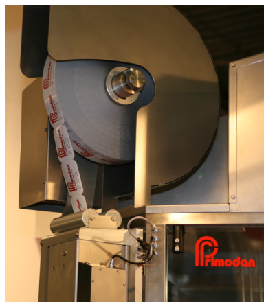
Picture: Position during production

A reel of approximately 40.000 lids is mounted in the filling/packing machine. The lids are automatically fed to the lid dispenser passing through a UV-C sterilizing unit. In the machine the lids are automatically separated and dispensed on the cups. The lids are produced by Primodan and can be supplied as metalized or non-metalized depending on the clients wishes and needs.