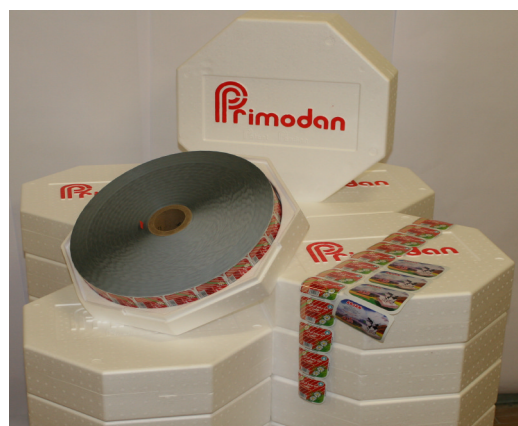
Picture: Lids from reels

Primodan reserves the right to make alterations without prior notice.